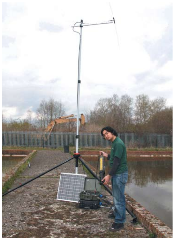
A "suitcase-sized" automatic water quality monitoring station for quick deployment and response

Three real-time AWQMS have been installed by the EA at the Olympic site with a further four YSI 6600 long-term logging sondes deployed to support data from six existing stations on the River Lee above the Olympic site. These monitors are able to raise alarms should any part of the construction process cause unacceptable harm to water quality so that work can be halted and the source of the problem identified and remedied. The stations are also helping Thames Water to protect and improve water quality in the area.