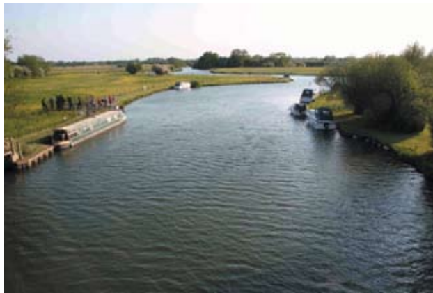
The Thames is the longest river in England and the most closely monitored for pollution.

CSO is the discharge, during rain storms, of untreated wastewater from a sewer system that carries both sewage and storm water (a combined sewerage system). The increased flow caused by the storm water runoff exceeds the sewerage system's capacity and the sewage is forced to overflow into streams and rivers in the area through CSO outfalls.