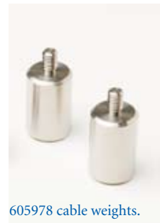
605978 cable weights.