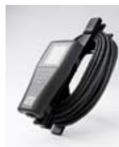
603062 cable management kit.