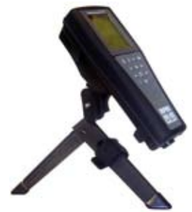
063507 tripod is ideal for lab situations.

* Special order cable lengths up to 100-meters in 10-meter increments available. ** Standard