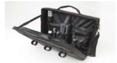
603075 soft-sided carrying case with Pro20, cable, and accessories.