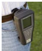
603069 belt clip.