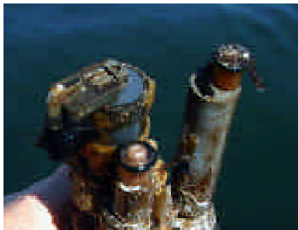
Figure 2. A prototype 6600 EDS after continuous deployment for 80 days in Buzzards Bay, MA. The sensor in the foreground is the active DO sensor. The sensor at top-right was used as a non-wiped fouling reference. Note extensive fouling by plant and animal species on the non-wiped sensor.

Building upon the unprecedented accuracy and reliability of YSI's stirring-independent Rapid Pulse™ dissolved oxygen system, as well as on the improved and proven wiped turbidity sensor, YSI has produced the YSI 6600 EDS (Extended Deployment System).