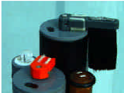
Figure 1. Profile of the new 6600 EDS depicting (clockwise from bottom-right), Rapid Pulse™ dissolved oxygen sensor, chlorophyll, pH/ORP, and turbidity, all of which are maintained free of fouling by the universal wiper assembly, as well as individual optical wipers.